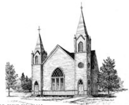
ARP CHURCH c. 1892 BARTOW